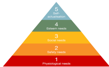
Fig. 2. Maslow's Hierarchy of Needs

According to Maslow's hierarchy of needs [Fig. 2], social needs are more fundamental than the need for self-actualization. Due to high levels of peer pressure preventing their social needs from being met, many Japanese people aren't able to find self-actualization. Consequently, Japanese people develop especially low self-esteem. Ultimately, as a consequence, this has the effect of divesting minorities of their basic human rights.