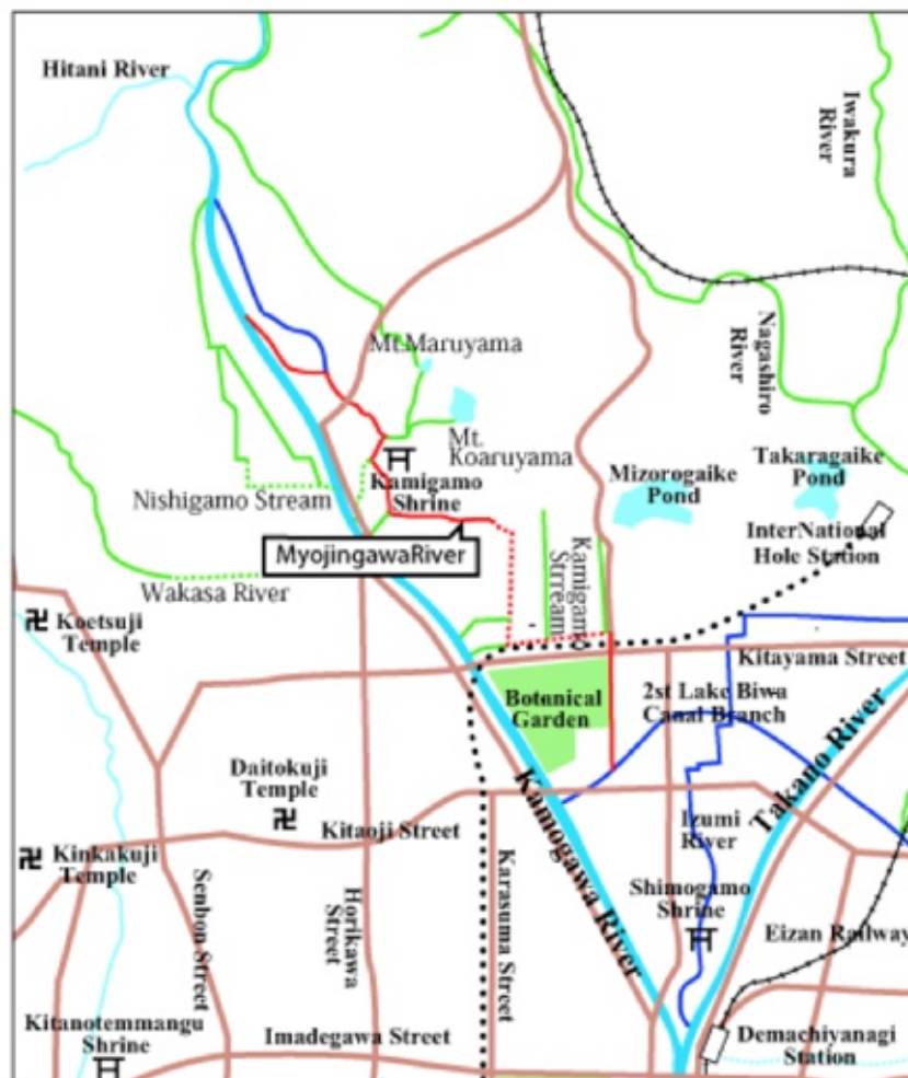
Fig. 2: Point of Myojin River