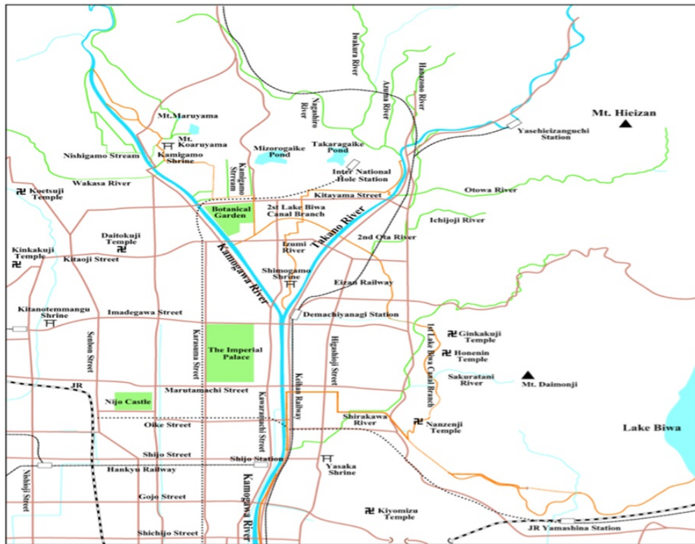
Fig. 1: Kyoto city central area