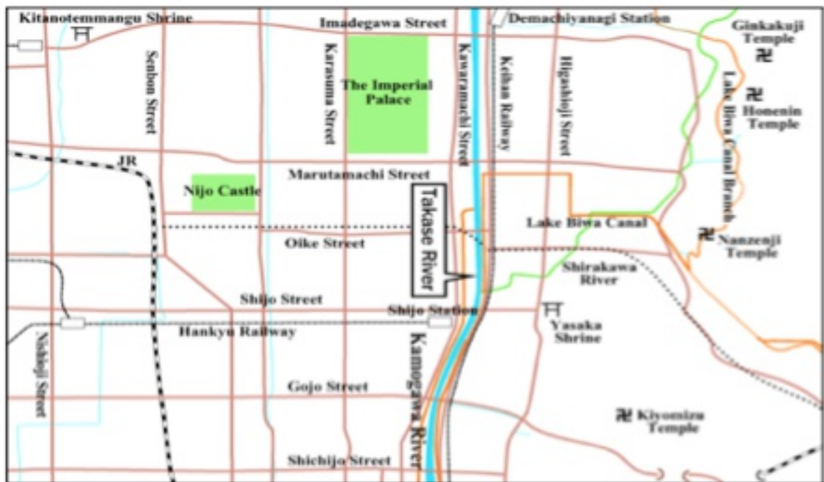
Fig. 5: Point of Takase River

made hill and soil walls, and stone are arranged so as to keep the ground at a specific level at many places. The water level of the pond rises up and down according to the level of the Takano River.