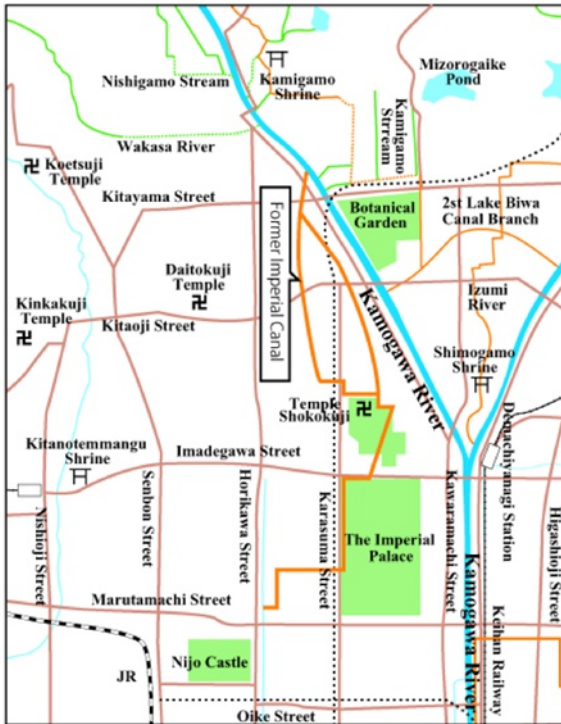
Fig. 4: Point of The former Imperial Palace Canal