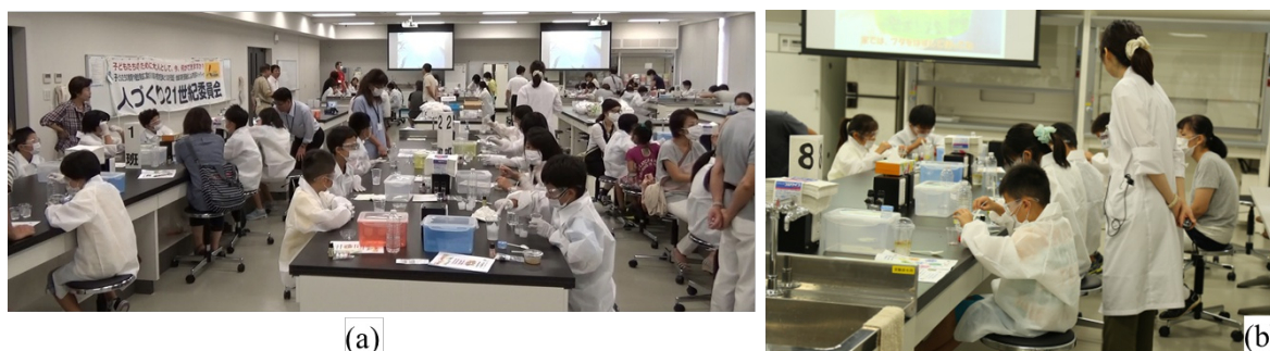
Fig. 2: Appearance of the science class with students wearing lab coat and safety glasses (a); and students were conducting the experiment under guidance of the academic staff of our university (b).

The practical sessions showed the science classes were conducted in a laboratory at our university (Fig. 2). The science classes were not only effective in mimicking interest in the experiments but also contributed to regional effort in promoting education because none of the students and only some of their parents had any laboratory experience at the university. Due to their keen interest in the science classes, students stayed focused on the experiments, enabling efficient delivery of a high-quality educational and safe performance of the experiments. As all the students wore safety glasses and white lab coats, in following the class and conducting the experiments, the attire instilled discipline and full attention to the importance of safety in the laboratory. Together, the safety attire and smooth running of the class and experiments provided a sense of achievement in the participating students. These safety attires could play an auxiliary role in enhancing the interest in science, because the students could get the feel of being a 'scientist' by wearing the functional attire and protective goggles. Indeed, the