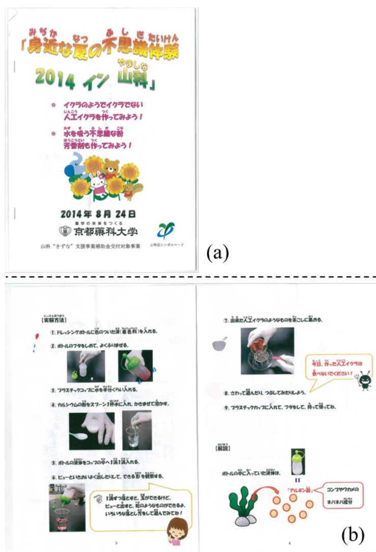
Fig. 1: Original text used in the class: (a) cover and (b) contents of the text.

The participating elementary school students were divided into two classes of ca. 60 students each (accompanied by their parents); i.e., morning and afternoon classes (each class lasted for 1.5 hours, and the science class was held twice in a day). In addition, 6 academics in our university and 16 volunteers in Yamashina ward as a lecturer attended each class (staff : student \approx 1 : 3). In these classes, two experiments (Exp) were designed as follows: Exp-1 involved preparation of colorful lookalike artificial salmon roe by taking advantage of the reaction of sodium alginate with calcium (calcium lactate); and Exp-2 demonstrated a powder (Kenis, Ltd.), or a similar product, which absorbs much water rapidly, can be also taken from a diaper etc.. Each student conducted the experiment